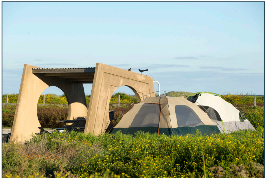
The proposed project would construct more campsites like this one, plus other facilities.

Historically, the state park provided camping facilities and associated amenities for day-use and overnight visitors. However, in 2008 Hurricane Ike devastated the upper Texas coast and destroyed much of the