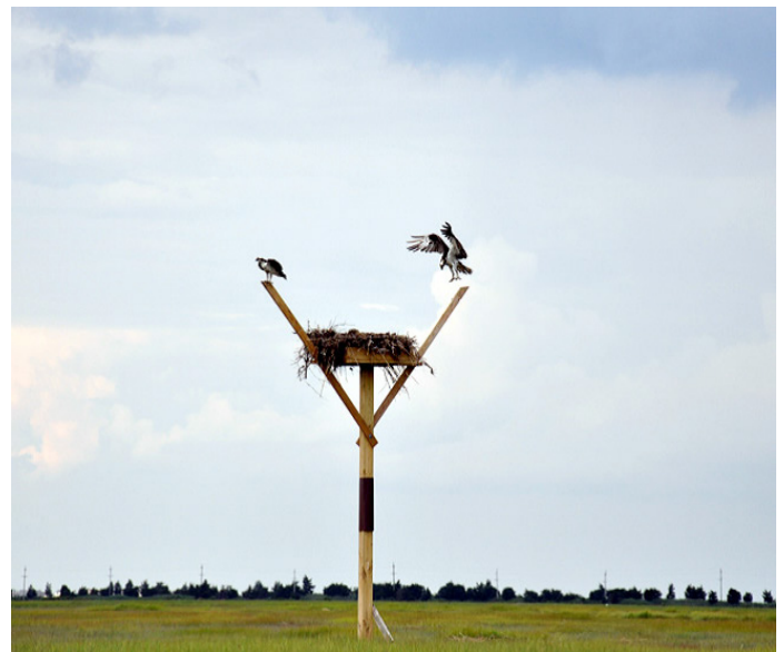
A typical osprey nesting platform.