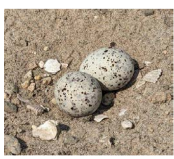
Least tern nest

Construction is ongoing. Sand is being dredged from an offshore borrow area and pumped onto 17 miles of shoreline in Jefferson and Chambers counties. Dune