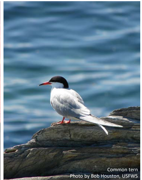
Common tern