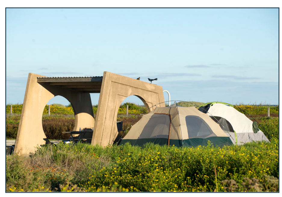
The proposed project would construct more campsites like this one, plus other facilities.

Historically, the state park provided camping facilities and associated amenities for day-use and overnight visitors. However, in 2008 Hurricane Ike devastated the upper Texas coast and destroyed much of the