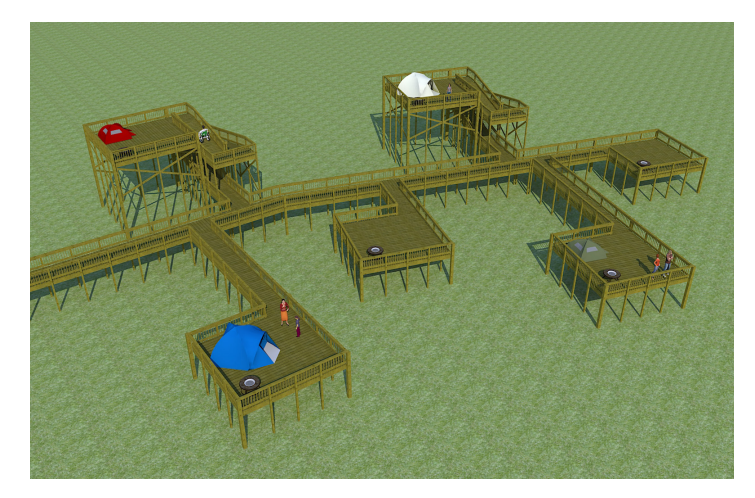
Artist's vision of a possible design for tent camping platforms at Galveston Island State Park.

The estimated amount of Deepwater Horizon Oil Spill early restoration funding proposed for this project is $10,745,060.