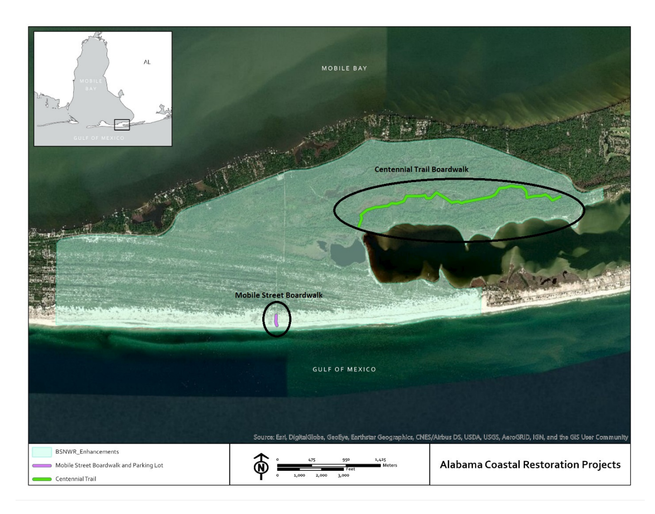
Figure 1: Location of BSNWR and the two action alternatives.