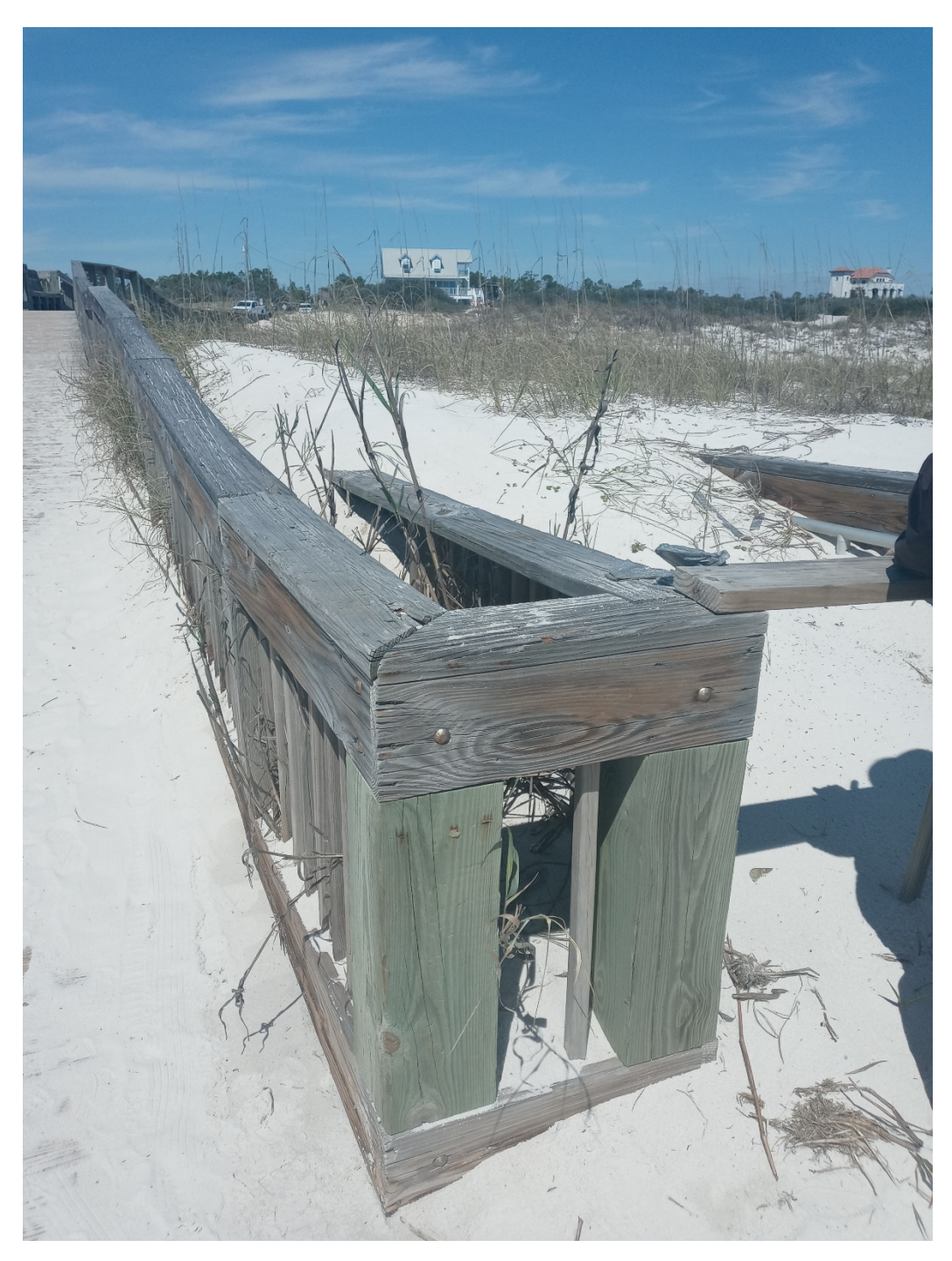
Figure 3: Mobile Street Boardwalk wheelchair ramp (right) completely overtaken by the dunes.