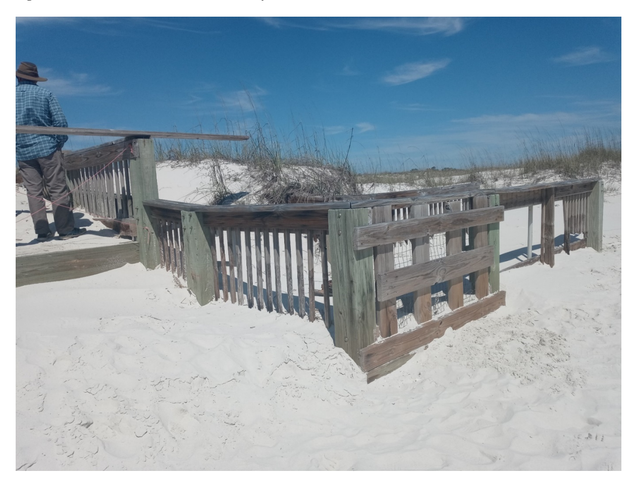
Figure 2: Mobile Street Boardwalk overtaken by sand.

The revised estimated cost to complete the project is $3,227,212, which includes the original cost estimate of $1,189,899 and an additional $2,037,313. The revised cost estimate reflects the additional costs of contracting E&D and construction, and the increased cost of materials and labor in February 2022. Some project activities have already occurred, including the completion of archaeological surveys.