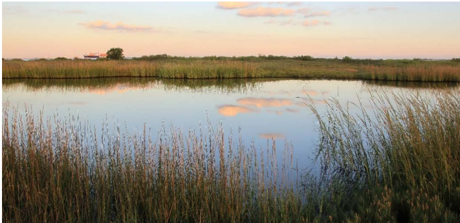
Intertidal marsh in Galveston Bay, Texas (Woody Woodrow, U.S. Fish and Wildlife Service).

The Galveston Island Habitat Acquisition project would protect in perpetuity 142 acres of barrier island habitat adjacent to Starvation Cove and Mentzel Bayou on Galveston Island in Galveston County, Texas. The property contains coastal, wetland, and upland habitats, including breeding and foraging grounds and migratory stopover habitat. Following purchase, a conservation easement would be placed on the tract. The estimated total project cost is $6,120,000. The Texas TIG would provide $1,120,000 to support land acquisition costs.