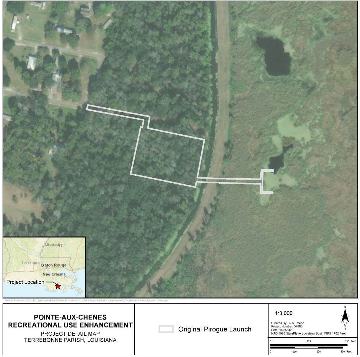
Figure 2. Old pirogue launch component (Alternative A) detail map.