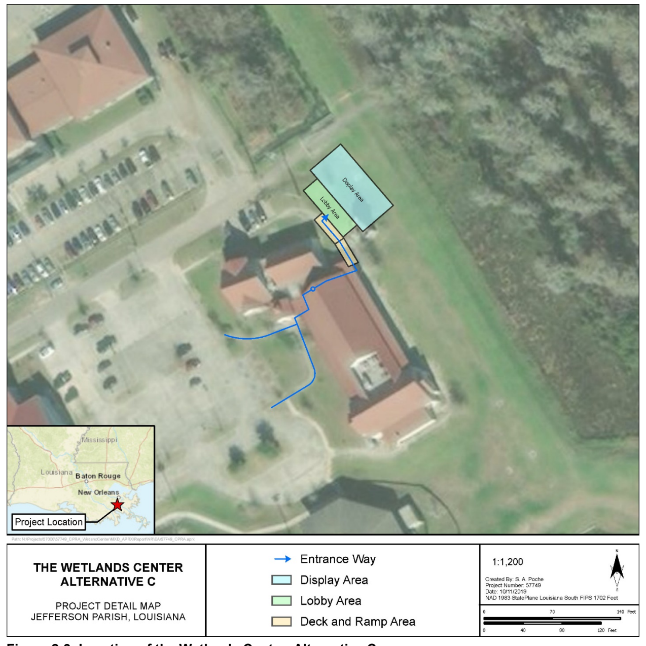
Figure 2-3. Location of the Wetlands Center, Alternative C.