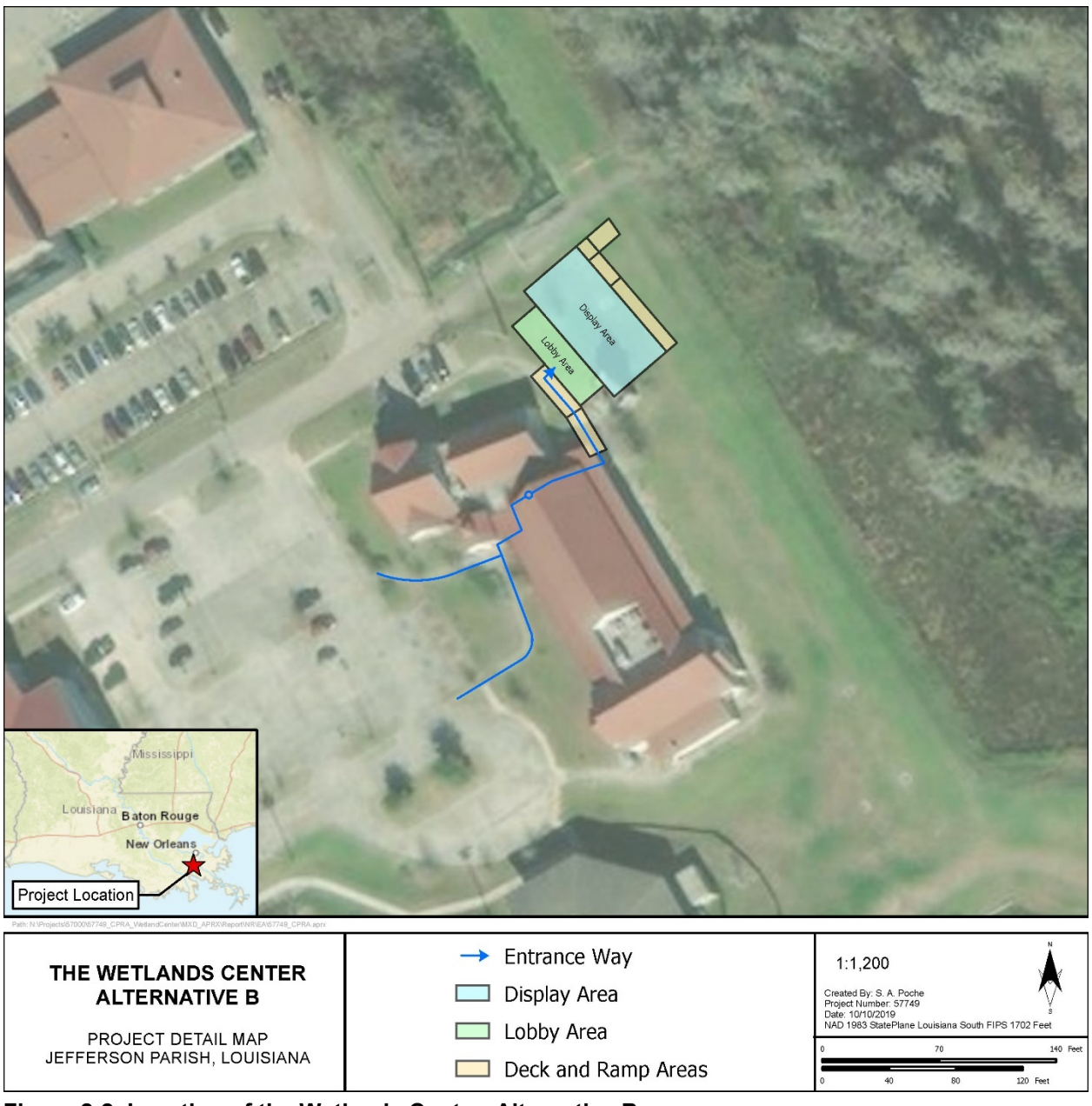
Figure 2-2. Location of the Wetlands Center, Alternative B.

The building foundation would be a combination of timber piles with concrete piers and cast-in-place concrete on driven piles. Public access to the Wetlands Center would be provided by an open-air walkway connecting the Wetlands Center with the Lafitte's Barataria Museum. Lafitte's Barataria Museum would be the main point of entrance for visitors accessing the Wetlands Center. The collocation of the two facilities would provide enhanced opportunities for the public to play and learn in one centralized area. The Town of Jean Lafitte would charge a combined entrance fee for the Wetlands Center, Lafitte's Barataria Museum, and the Nature Study Trail to help fund operation and maintenance costs for these facilities. The current admission fee for Lafitte's Barataria Museum is $6.00. The entrance fee could be adjusted as the Town of Jean Lafitte monitors the operation and maintenance costs for the Wetlands Center over time. This proposed location under Alternative B would also avoid construction within wetland habitats when compared to Alternative A.