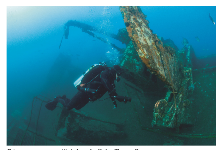
Diver near an artificial reef off the Texas Coast

The location for the Corpus Reef Project was selected after request for and consideration of public input and in accordance with site selection guidelines set out in the Texas Artificial Reef Fishery Management Plan (TPWD 1990). Consultations began with the Saltwater-Fisheries Enhancement Association and the City of