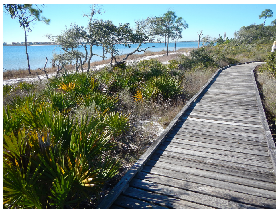
A portion of the existing Jeff Friend Trail as it runs parallel to the shores of Little Lagoon.

The project will replace the 1,250 foot wooden portion of the trail with a composite material boardwalk. The 3,700-foot gravel portion of the trail will be replaced