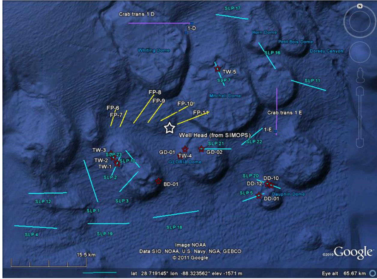
Figure 2. Proposed HOS Sweet Water Cruise 4 and 6 near-field transects: fallout plume FP-6 to FP-11; crab transects 1B, 1D, and 1E (purple) and near-field slope transects (blue, SLP). The white star is the location of the wellhead. The brown star icons represent potential seep recon sites on/near Dauphin Dome (DD-01, DD-10, DD-12), Biloxi Dome (BD-01, TW-1, TW-2 and TW-3), and Gloria Dome (GD, TW-4).

In addition, several transects are planned in cruise 4 (i.e. Leg 1) to allow early reconnaissance of selected seep locations (Figure 2) to inform approaches to seep sampling and flux measurements during this and later cruises. To avoid confusion with the previous station locations occupied during legs 2 and 3 of the HOS Sweetwater 2 cruise, the proposed transects for this cruise plan (see Figures 3 to 8 in Attachment 1) are identified as: