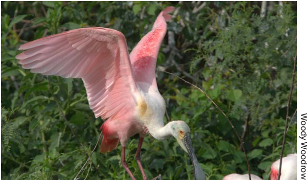
Roseate Spoonbill is a species that will benefit from the creation of nesting habitat from this project.