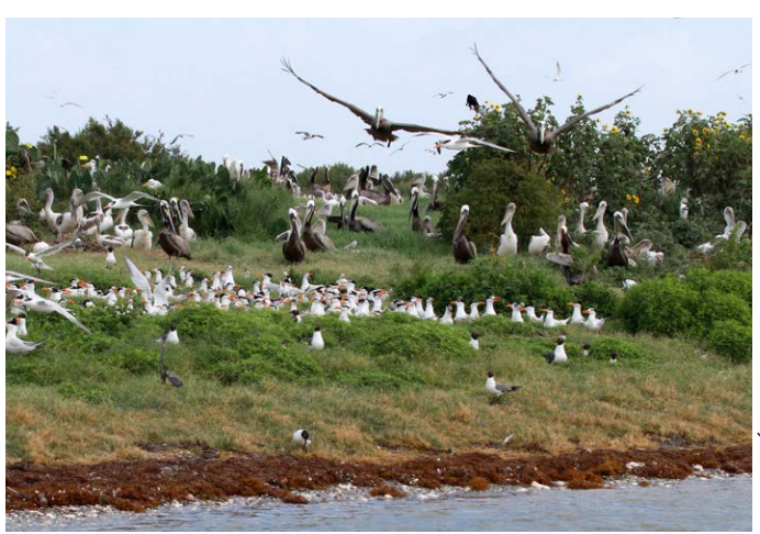
Tri-colored herons, brown pelicans, royal terns, and laughing gulls congregate to nest on Evia Island in Galveston Bay.